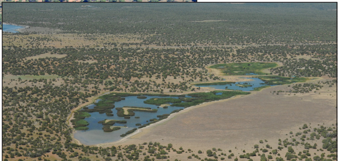
Aerial photos of some of Show Low's system of created wetlands, all north of the city proper, that process our wastewater. The top photo shows Ned Lake (foreground), Telephone Lake and the polishing ponds looking easterly. The photo at left is Redhead Marsh at the far west end of the system. The bottom photo shows Pintail Lake, a popular tour stop for local schoolchildren.